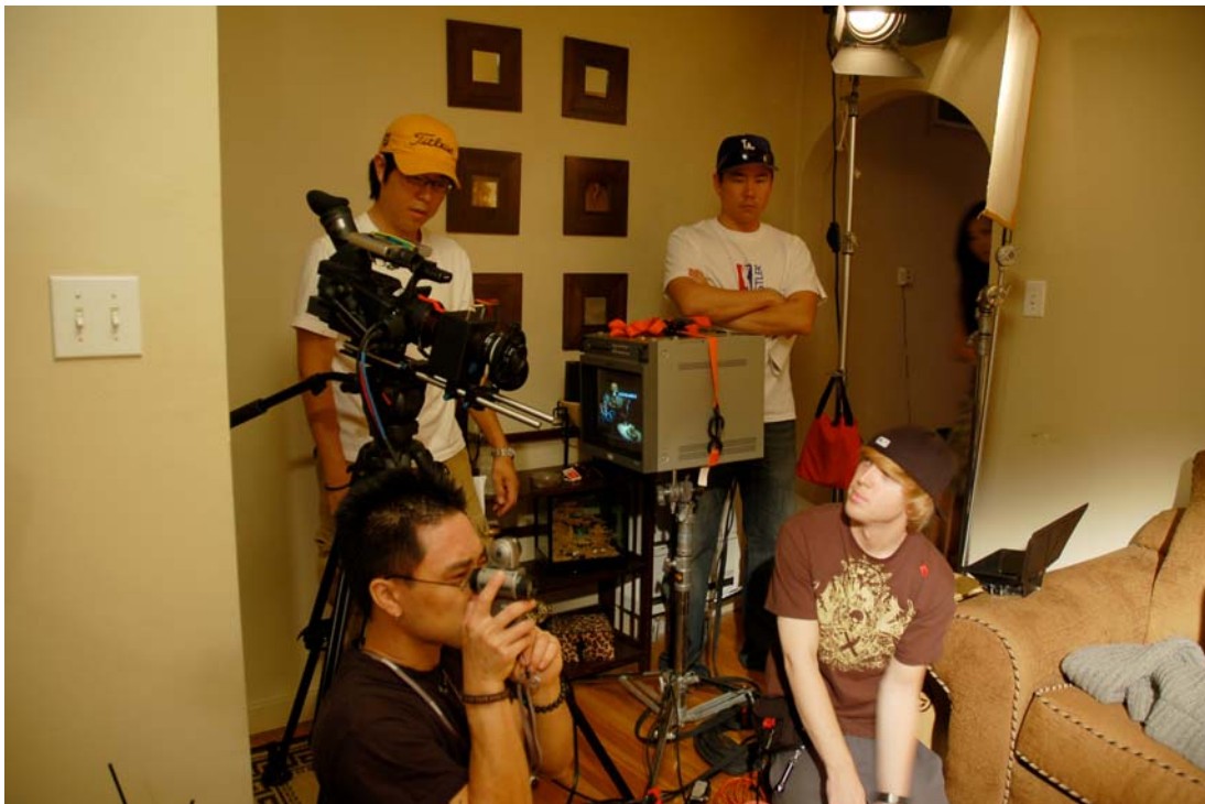
The crew crams into a small living room to get the next shot.